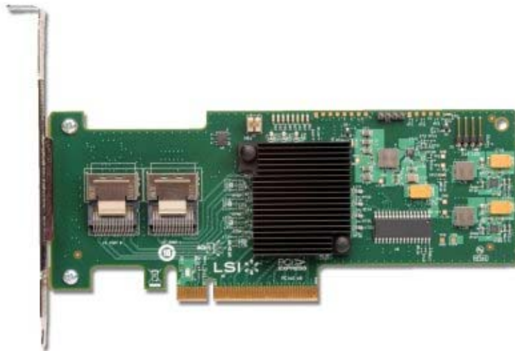
Figure 1. ServeRAID M1015 SAS/SATA Controller

The ServeRAID M1015 SAS/SATA Controller for IBM System x is an entry-level 6 Gbps SAS 2.0 PCI Express 2.0 RAID controller. The adapter has two internal mini-SAS connectors to drive up to 16 devices and supports the same base RAID 0, 1, and 10 feature set and drivers as the M5000 series controllers. With the attachment of the ServeRAID M1000 Advanced Feature Key, the ServeRAID M1015 offers the option of RAID 5 and SED Encryption Key management, while still being sensitive to administrator cost concerns in an entry-level RAID environment. This RAID controller provides connectivity to internal direct-attach or expander-attached hard disk, solid-state, or self-encrypting drives.